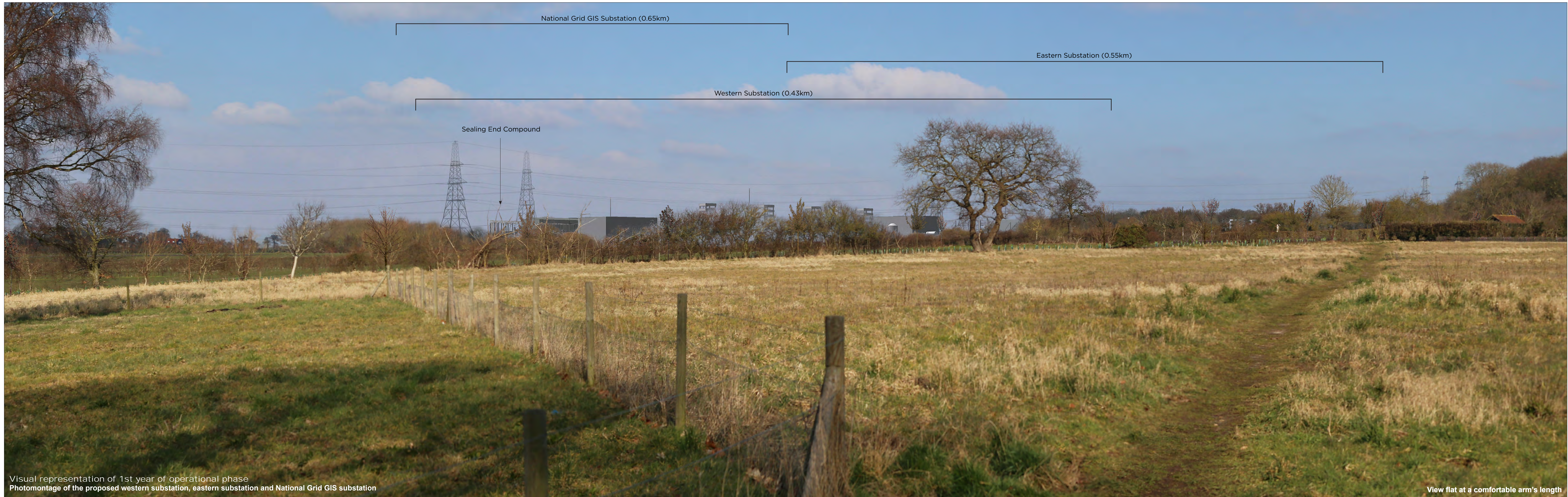
Visual representation of 1st year of operational phase Photomontage of the proposed western substation, eastern substation and National Grid GIS substation