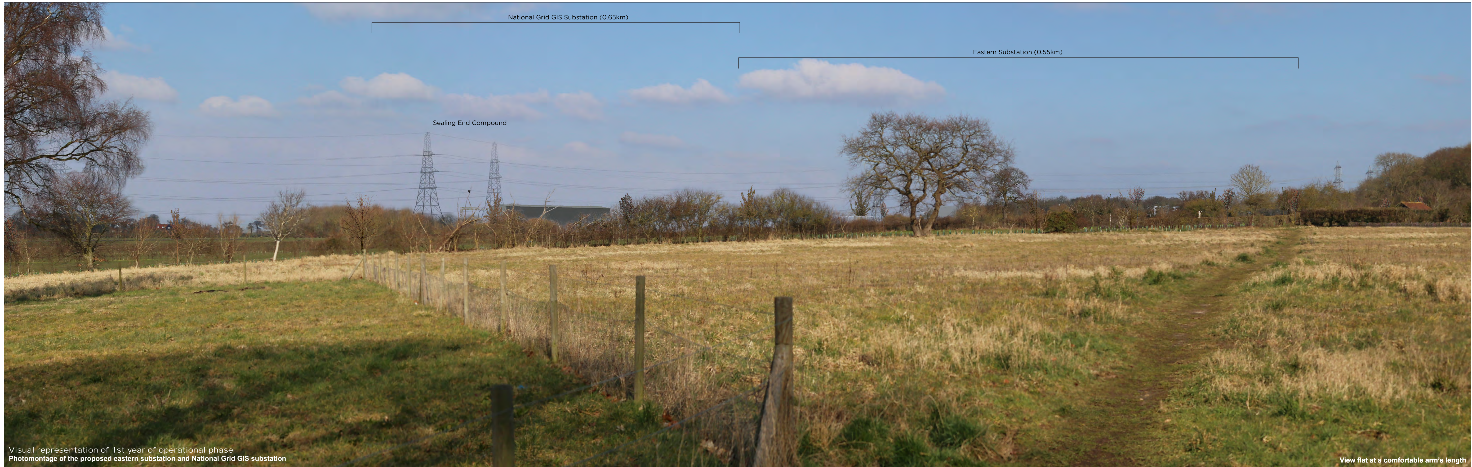
Visual representation of 1st year of operational phase Photomontage of the proposed eastern substation and National Grid GIS substation