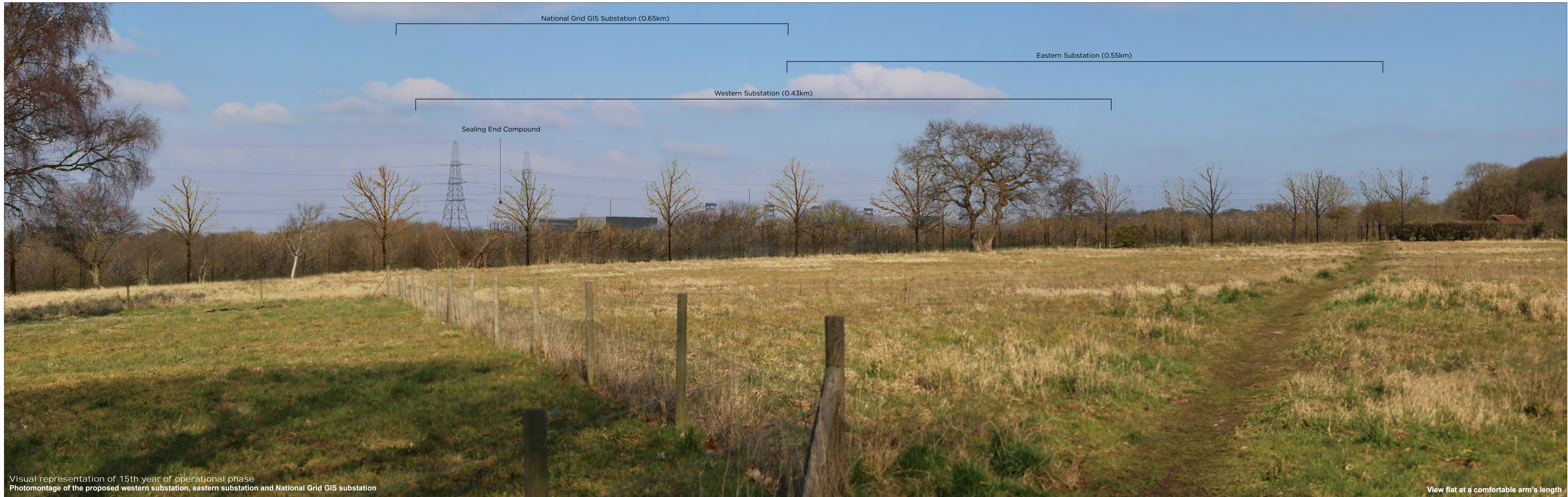
Visual representation of 15th year of operational phase Photomontage of the proposed western substation, eastern substation and National Grid GIS substation