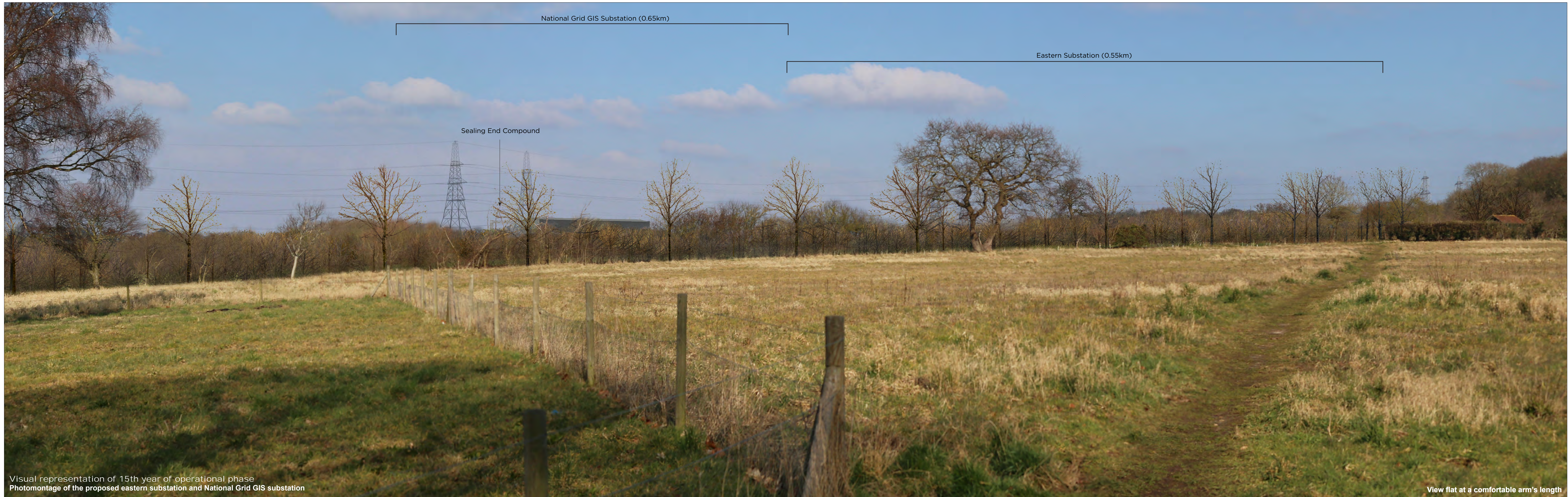
Visual representation of 15th year of operational phase Photomontage of the proposed eastern substation and National Grid GIS substation