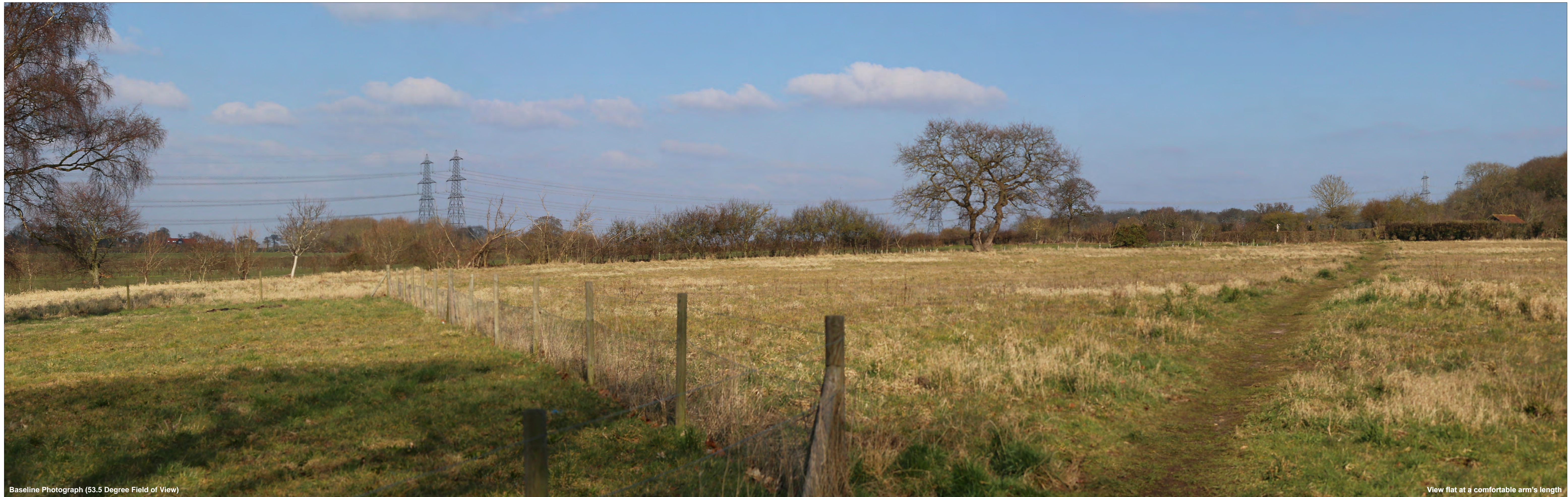
Baseline Photograph (53.5 Degree Field of View)