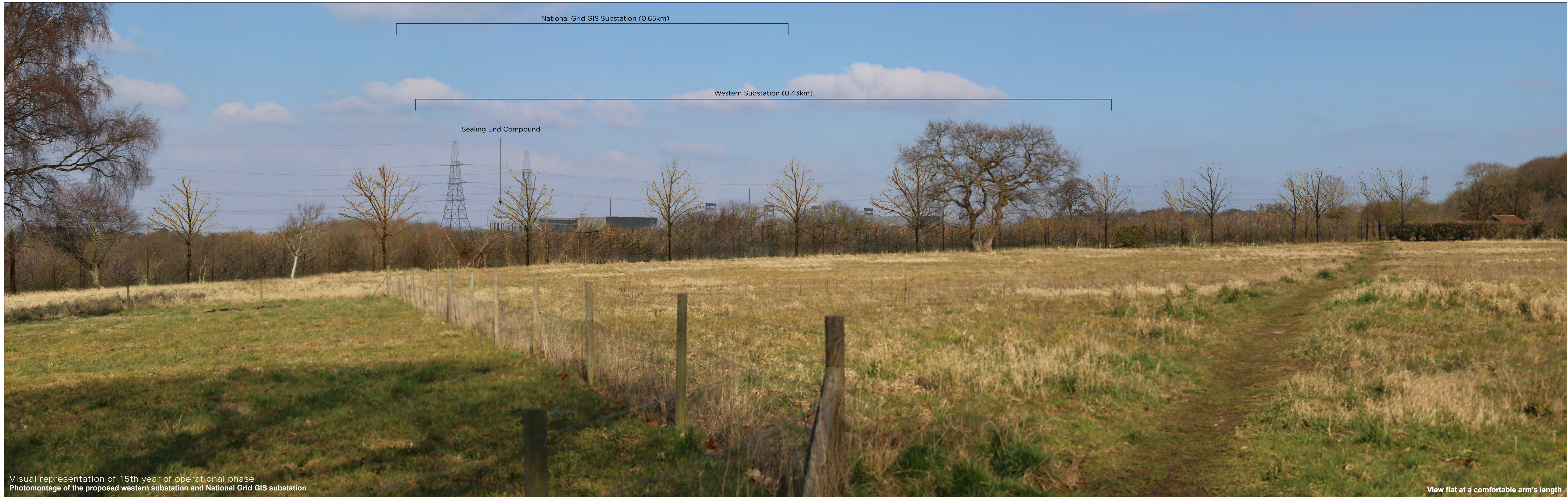
Visual representation of 15th year of operational phase Photomontage of the proposed western substation and National Grid GIS substation