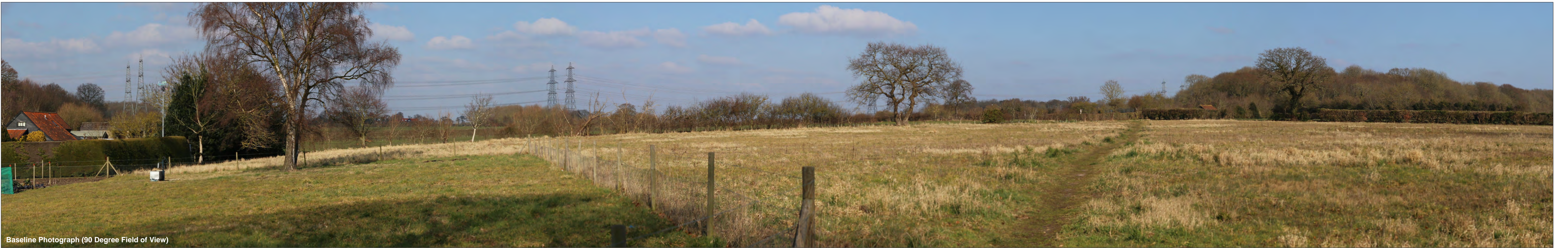
Baseline Photograph (90 Degree Field of View)